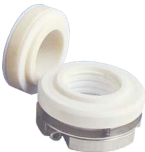
ISPL-2405A Face Impregnated