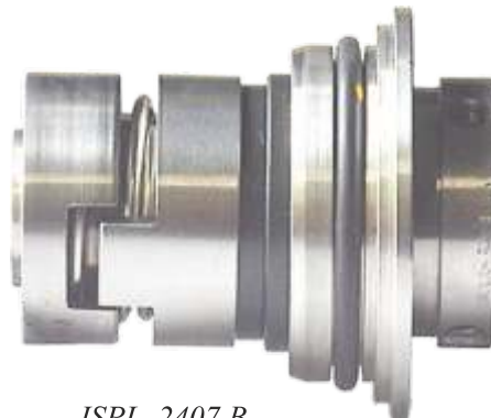
ISPL 2407 B