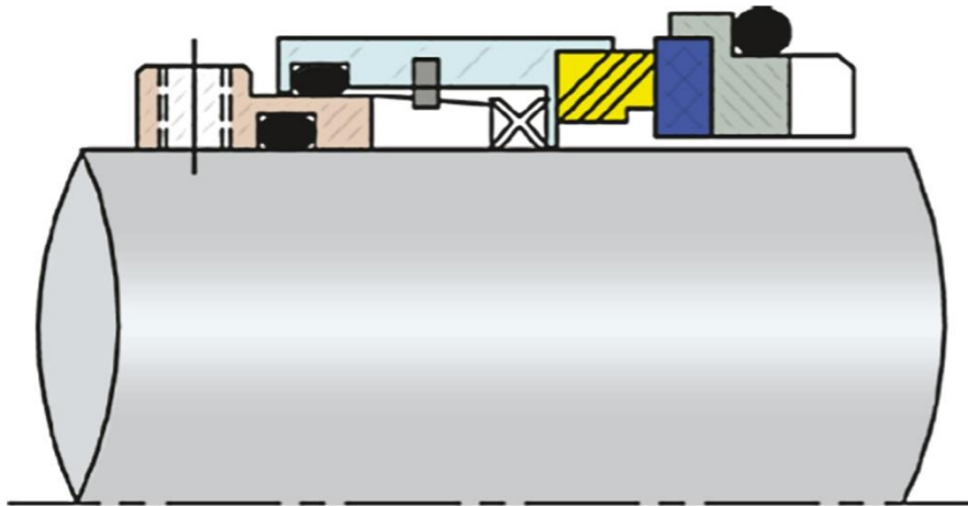
ISPL-2428 Balanced Type Wave Spring Seal