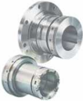
ISPL 2419 Boiler Feed Pump