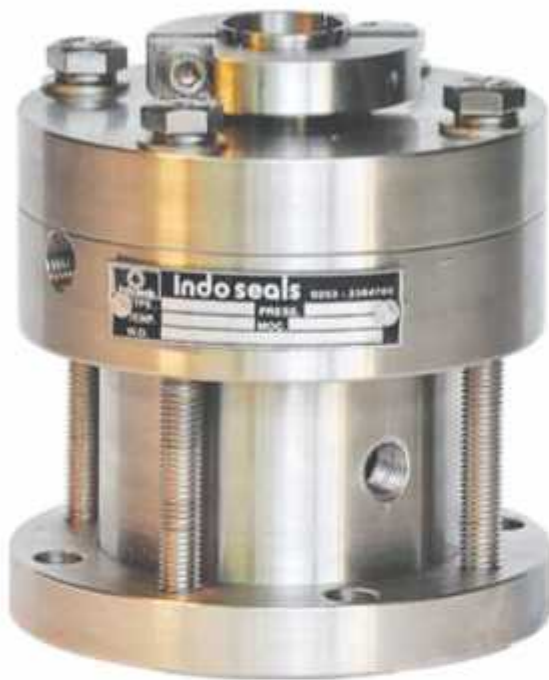
ISPL 24558 Double Agitator Seal with bearing