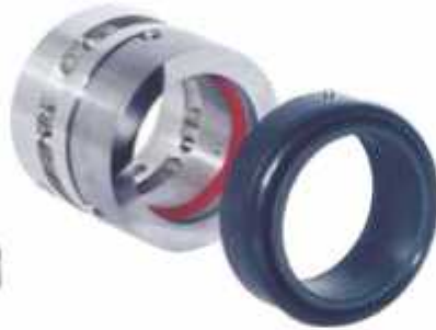
ISPL 2409 I.S. Balanced Seal