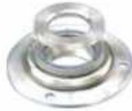
ISPL 2420 Accurate Seal