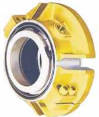
ISPL 2418 Split Seal