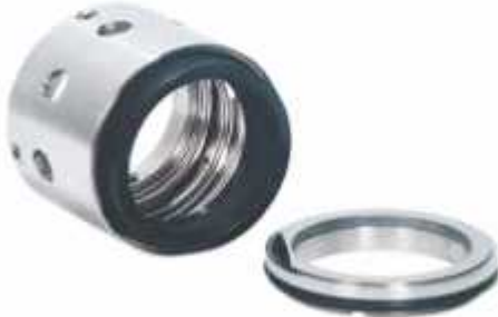
ISPL 2411 Single Spring Seal