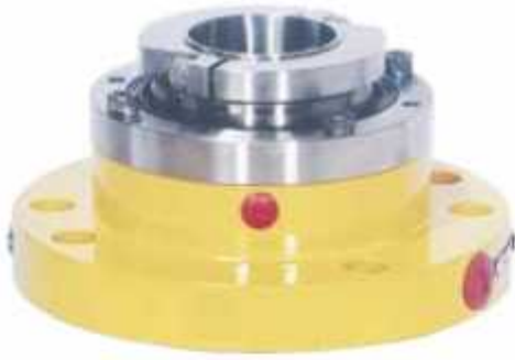
ISPL 24555 Single Seal