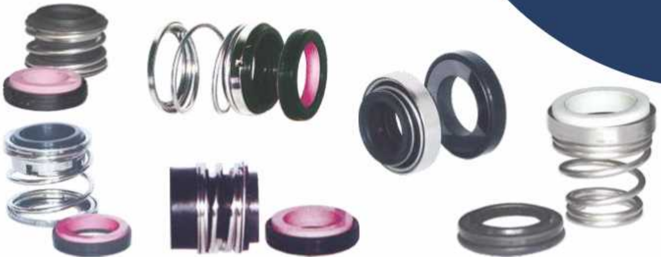
ISPL 2412 Water Pump Seals