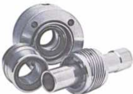
ISPL 2416 Thermodynamic Seal