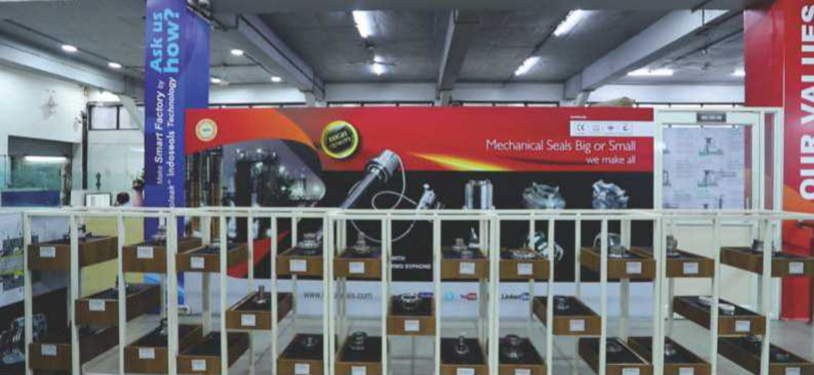
INDO SEALS SHOWROOM