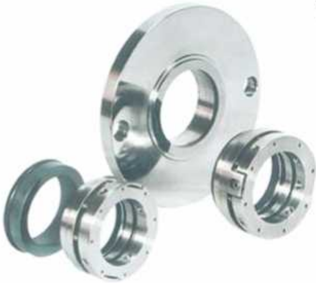
ISPL 2422 RTBS Seal