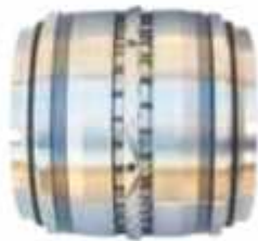
ISPL 2424 Pressure Screen Seal