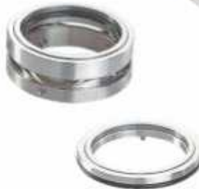
ISPL 2426 Wave Spring Seal