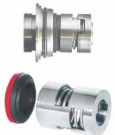
ISPL 2407 Star Mechanical Seal