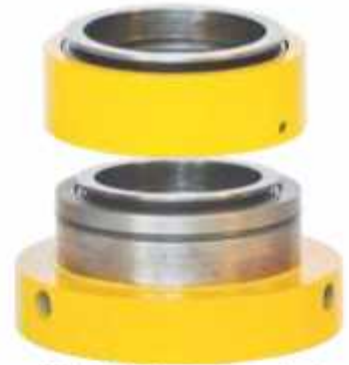
ISPL 2421 Springless Seal