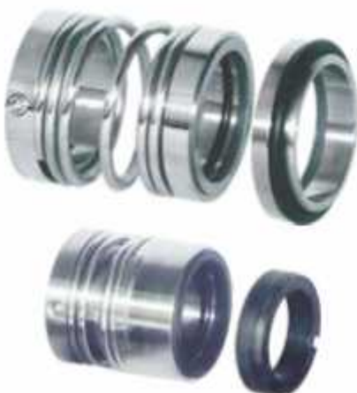
ISPL 2406 Straight Spring Seal