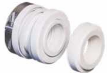
ISPL 2404 Teflon Bellow Seal