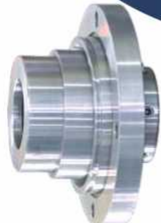
ISPL 2429 Side Entry Cartridge Seal