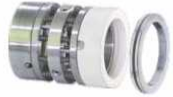
ISPL 2408 Double Mechanical Seal