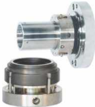
ISPL 2417 Dry Seal