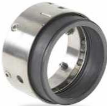
ISPL 2402 Balance Multi Spring Seal