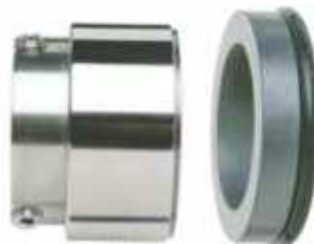
ISPL 2428 Balanced Wave Spring Seal