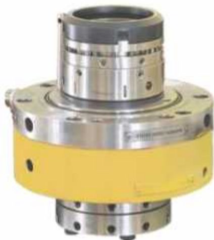
ISPL 24558 Double Agitator Seal with bearing