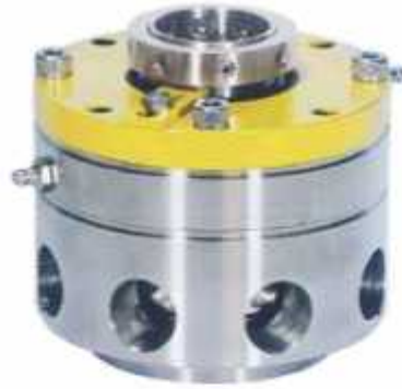
ISPL 24556 Single Seal with bearing