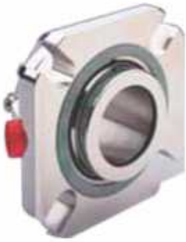
ISPL 2413 Multispring Cartridge Seal

ANFD AGITATOR SEAL WITH METAL BELLOW & THERMO SYPHONE SIZE: 110mm SHAFT