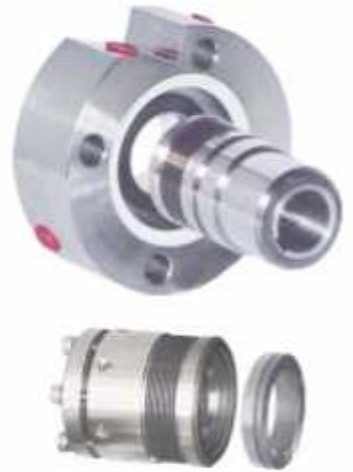
ISPL 2415 Steel Bellow Seal