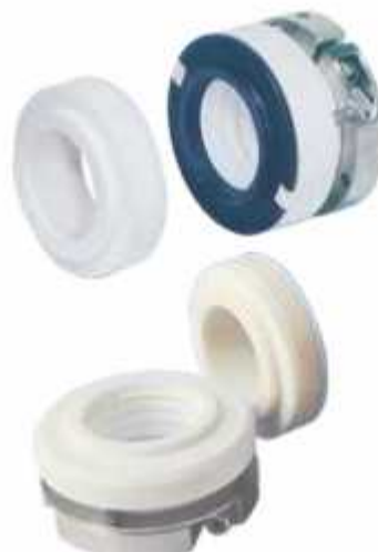
ISPL 2405 Teflon Bellow Seal