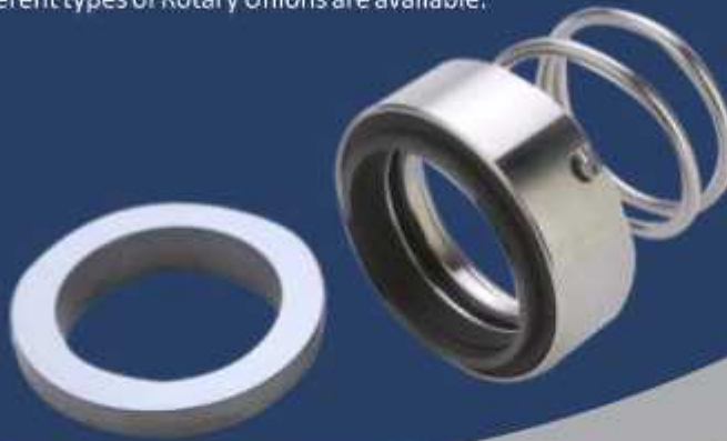
ISPL 2401 Conical Spring Seal

Indo Seals offers single coil spring, multi spring, Wave spring, Double mechanical & custom built seals which can be used under various corrosive, viscous, toxic and highly inflammable pumping fluid applications. Complete cartridge assembly with drive for reactors and agitators. Different types of Rotary Unions are available.