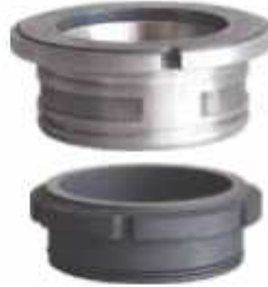
ISPL 2423 Heat Exchanger Seal