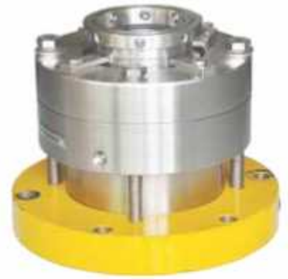
ISPL 24557 Double Mechanical Seal