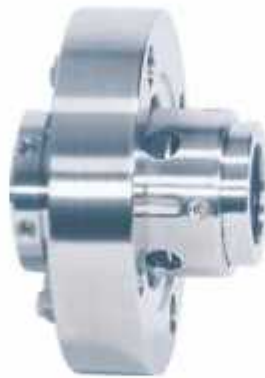
ISPL 2414 Cartridge Seal