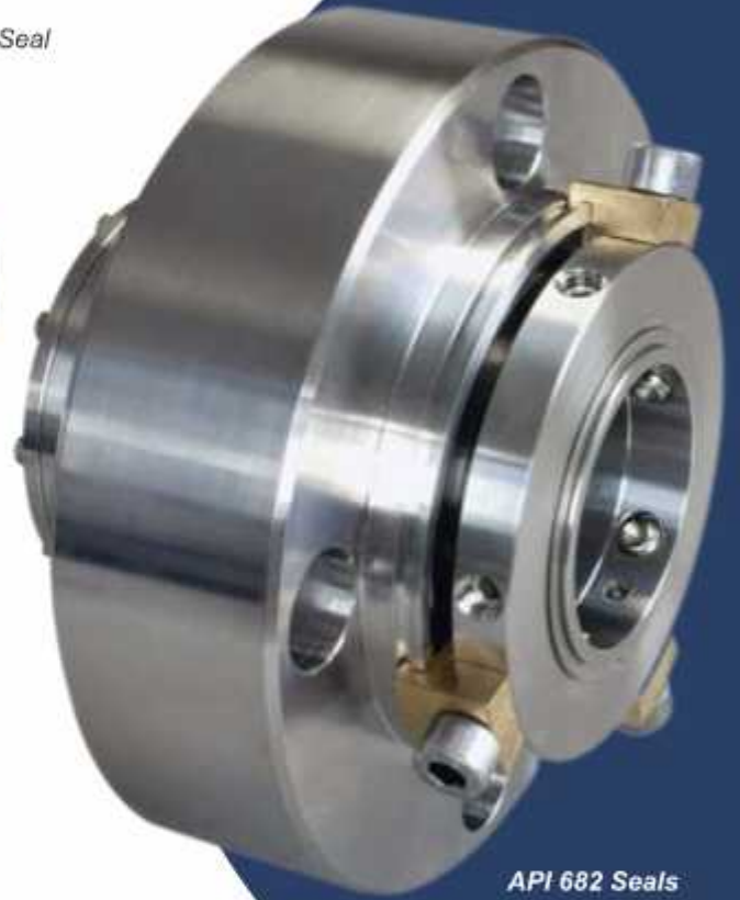
API 682 Seals