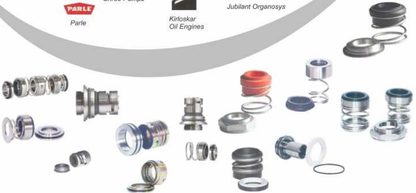
Pharma / Breweries / Milk Dairy Seals