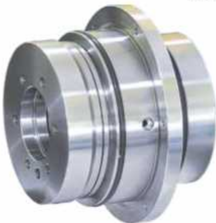
ISPL 2427 Grinding Mill Seal