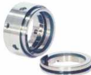
ISPL 2403 Multi Spring Seal